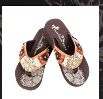
MANDALA FLORAL Stone concho Embroidered Wedge Sizes: Assorted Colour: Brown Š30/each