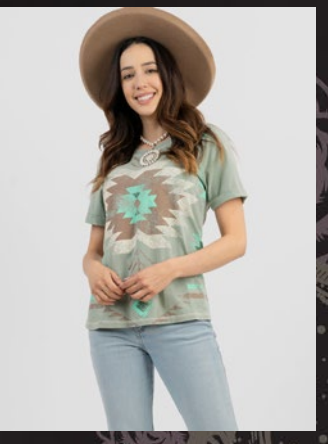
GREEN VINTAGE AZTEC TRIBE SIZES: SM. M. LG. XL. 2XL $20/each