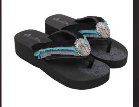
MANDALA CROSS Frindge Wedge Western Sizes: Assorted Colour: Black §30/each