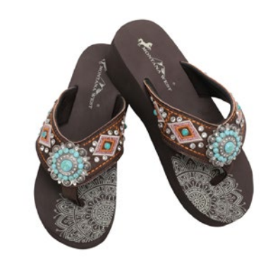
MANDALA TURQUOISE stone concho Embroidered Wedge Sizes: Assorted Colour: Coffee Š30/each