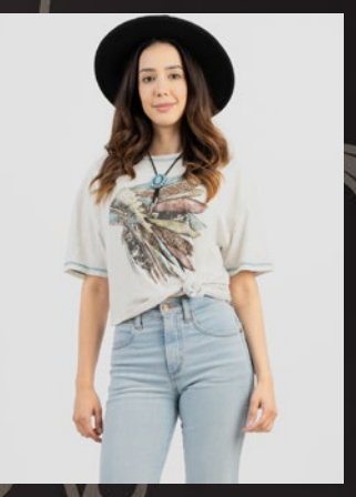
WASHED TRIBE VINTAGE SIZES: SM, LG. XL. 2XL $20/EACH