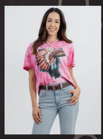
PINK TIE DYE TIARA SIZES: SM. M. LG. XL. 2XL $20/EACH