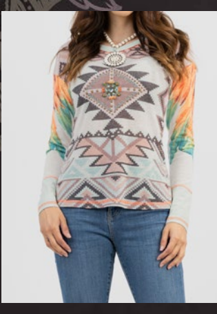
AZTEC GRAPHIC SIZES: SM. M. LG. XL. 2XL Š28/EACH