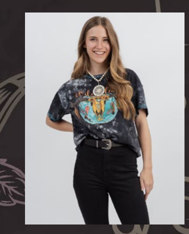
TIE DYE - WILD COW SIZES: SM. M. LG. XL. 2XL Š20/EACH