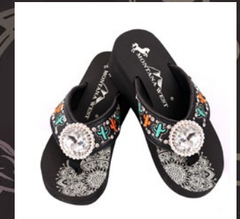
MANDALA CACTUS Embroidered Wedge Sizes: Assorted Colour: Black Š30/each