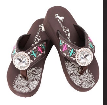
MANDALA CACTUS Embroidered Wedge Sizes: Assorted Colour: Brown Š30/each