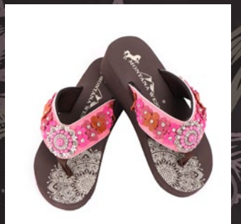
MANDALA FLORAL Stone Concho Embroidered Wedge Sizes: Assorted Colour: Pink $30/each