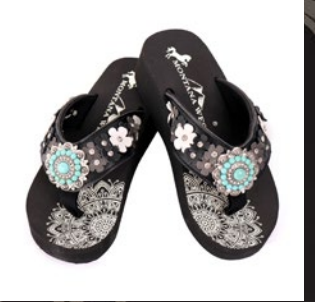
MANDALA FLORAL stone concho embroidered wedge sizes: Assorted colour: Black $30/each