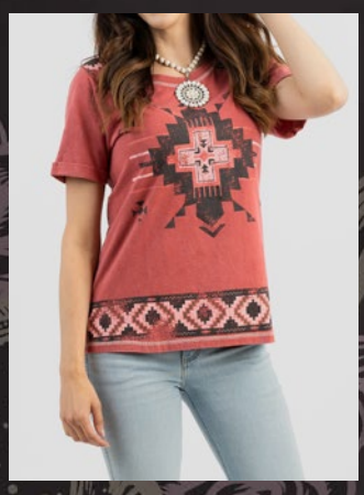
RED VINTAGE AZTEC TRIBE SIZES: SM. M. LG. XL. 2XL $20/each