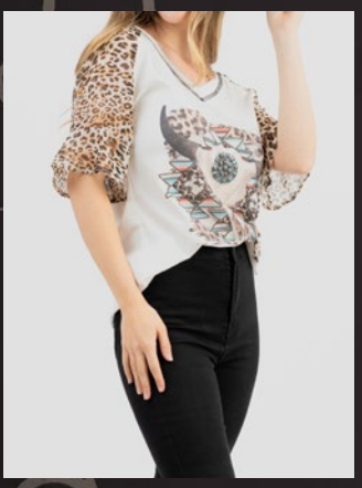
LEOPARD PRINT GRAPHIC SIZES: SM. M. LG. XL. 2XL $24/EACH