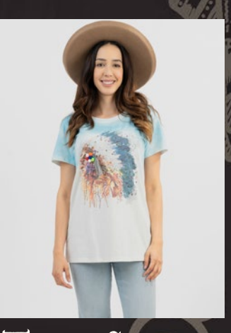
TRIBE GRAPHIC SIZES: SM. M. LG. XL. 2XL $24/EACH